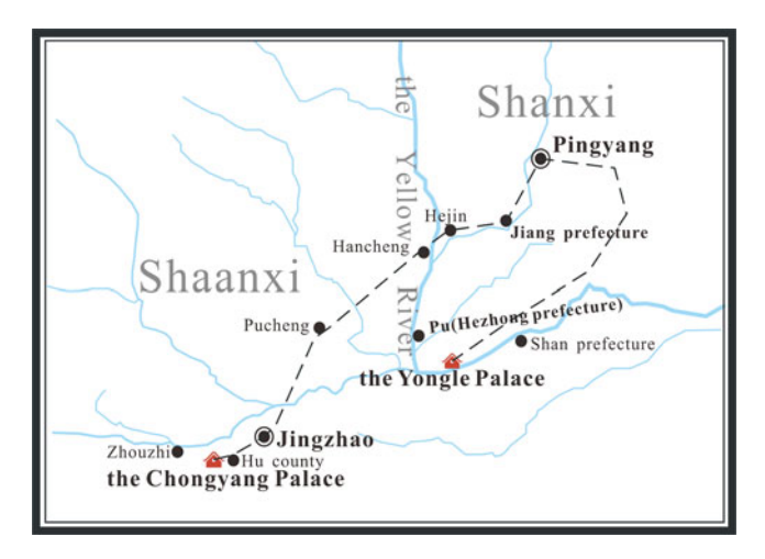
Figure 2. The likely route of the procession of Song Defang's coffin from the Chongyang Palace to the Yongle Palace. Drawing by Yu Kang.

Hezhong prefecture, it seemed unreasonable that the procession continued northward to Jiang (present-day Xinjiang county 新绛縣) and Pingyang (present-day Linfen 臨汾) rather than going straight to the Yongle Palace, unless taking this long way round was a deliberate plan. While the available sources are not sufficient to draw a definitive conclusion about the exact route the procession took, Figure 2 depicts a likely route. The illustration highlights the significant detour the procession made in southern Shanxi.