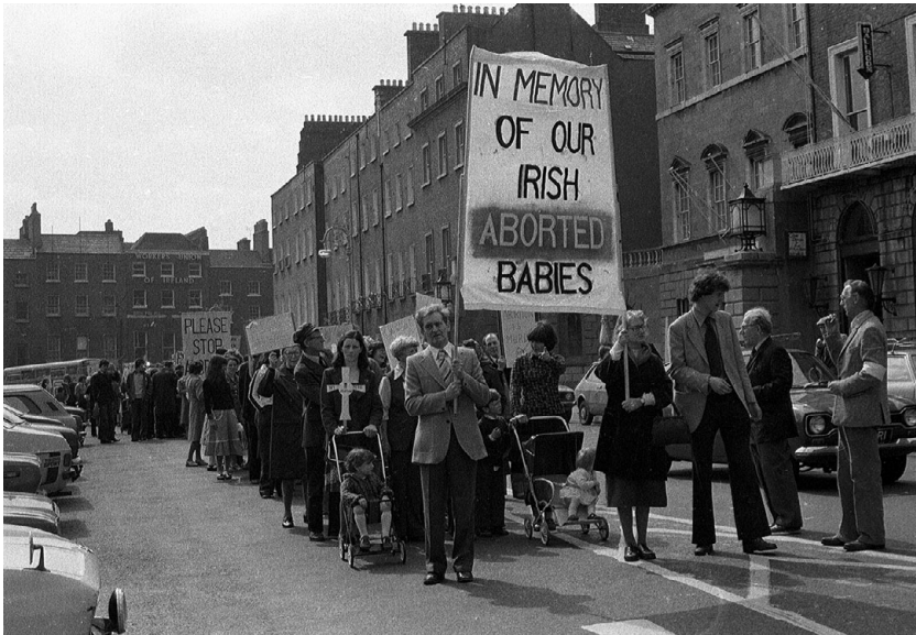
Figure 8.3 Pro-life march and rally, GPO, Dublin, 12 May 1979.