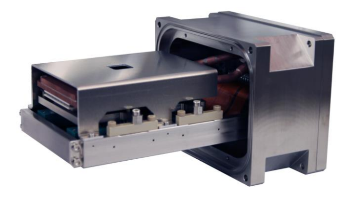
Figure 1. The pnCCD camera for TEM applications.