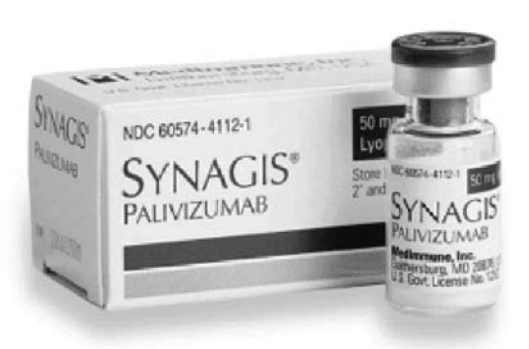
FIGURE 5.2 The dispute in MedImmune v. Genentech involved a Genentech patent claiming antibody technology. Because MedImmune's allegedly infringing drug Synagis generated 80 percent of its revenue, MedImmune accepted a license from Genentech and paid royalties "under protest," then sought to invalidate the patent.