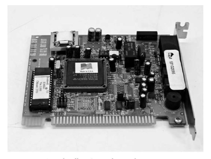
FIGURE 5.4 A Rockwell 33.6 K analog modem, c.1990s.

Rockwell first argues that the district court erred by denying its motion for JMOL on the breach of contract claim. Citing the prior art submitted to the United States Patent and Trademark Office (PTO) by Celeritas, Rockwell argues that the evidence at trial clearly demonstrates that the de-emphasis technology disclosed to Rockwell was already in the public domain. Even if the technology were proprietary at the time of disclosure, Rockwell argues, the technology had entered the public domain before Rockwell used it, concededly no later than March 1994. Specifically, Rockwell asserts that AT&T Paradyne had already placed the technology in the public domain through the sale of a modem incorporating de-emphasis technology ("the modem"). Rockwell asserts that the technology was "readily ascertainable" because any competent engineer could have reverse engineered the modem. Rockwell further argues that any confidentiality obligation under the NDA regarding de-emphasis technology was extinguished once the '590 patent issued in January 1995.