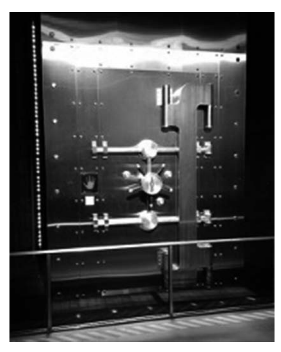
FIGURE 5.3 The formula for Coca-Cola, which is allegedly stored in this imposing vault in Atlanta, has been a trade secret since 1886.

Celeritas Technologies, Ltd. v. Rockwell International Corp. 150 F.3d 1354 (Fed. Cir. 1998)