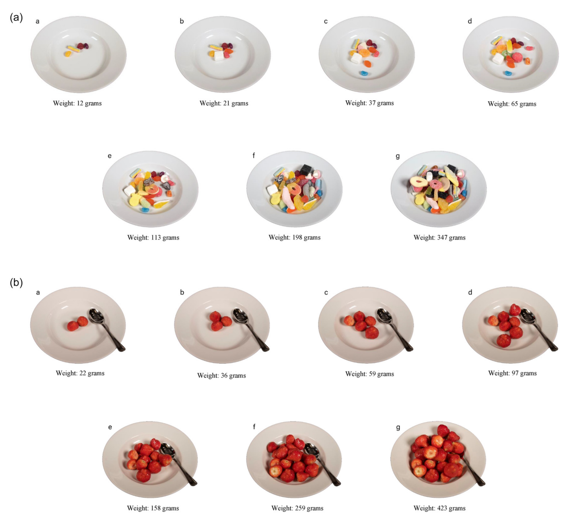
Fig. 1. Examples of image-series with the letters A-G edited in to assist portion size image identification: (a) candy and (b) strawberry.

median (25 %, 75 %), as these data were not considered as normally distributed.