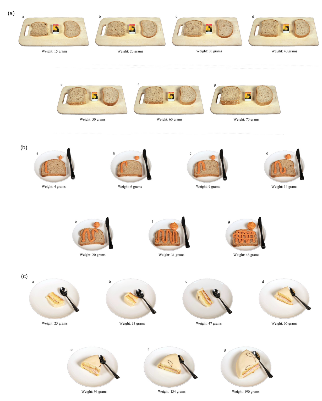
Fig. 3. Example of image-series that performed poorly in estimating portion size: (a) bread, (b) caviar spread and (c) marzipan cake.

further supported by the study by Lillegaard et al. including children and adolescent showing a wider range in both under- and overestimation (0 to 142 %), compared to our results<sup>(34)</sup>. Other studies validating food images in adults have found both greater and lesser degree of misestimation compared to our results<sup>(20,38)</sup>.