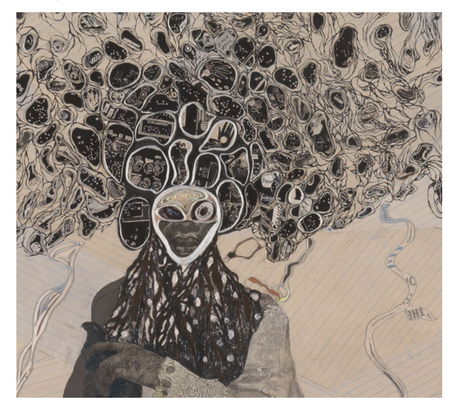
Figure 4. Detail from Bird in Hand , 2006, Ellen Gallagher. Tate, presented anonymously 2007. © Ellen Gallagher.

prompt for recognizing how the use of scale in her visuals fields – drawing the eye to repeated microscopic detail within bigger works or confusing scale in a potentially estranging way – might be a formal confrontation with technologies and habitual modes of looking. In Bird in Hand , viewers are brought to awareness of their act of peering in and "reading" small features, with a reflexivity about the optics and possible politics involved in such engagement. The rims of the Afro cells are built up in relief from cut and pasted paper layers and silver paint, adding a sense of depth or even of looking through apertures, which itself summons up apparatus for magnification or seeing into.<sup>70</sup> Once we are up close, the obliterations to redact some nodule details serve to undercut the aspirational magazine images, and the modified text captions