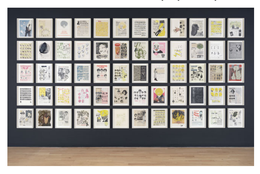
Figure 1. DeLuxe , 2004–5, Ellen Gallagher. Tate, purchased 2006. © Ellen Gallagher.

time, adjacent material sourced from the same magazines touts cures for physical ailments such as corns, headaches, nervous stomachs, bad backs and so on. This both draws attention to the wear on, and pains of, the labouring, implicitly Black, body, and suggests a link between well-being and commodity, between economic buying power (that is, wealth) and good health. The appeal of the training advertisements' promissory images is undercut by awareness of health inequality and the entanglement of medical institutions in wider narratives of progress and profit. The mix of historical referents, via Rivers of Tuskegee and promotions peddling health cures and career paths to "uplift," ensures that the nurse accrues a dense set of meanings, which speak to Gallagher's critical take on capitalist modernity.