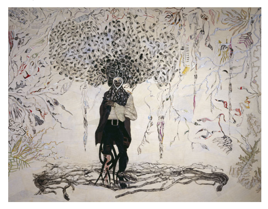
Figure 3. Bird in Hand , 2006, Ellen Gallagher. Tate, presented anonymously 2007. © Ellen Gallagher.

and appear against a black background, with the density of images and of the dark tones decreasing as the hair spreads out, increasingly looking jellyfish-like. In the larger nodules we find headlines and bits of promotional text. <sup>66</sup> Partially blacked-out inset images show corsets, hair models and jewellery. These, like the text, suggest a commercialization of particular beauty ideals, an elevation of certain visions of success, and the false promises of US culture and society in general. While not a grid work, Gallagher's recapitulation here of a large-scale scheme with telling details contained within myriad smaller units demands a zooming in and out, and enables the unfolding of multiple concerns and historical and cultural references. An openness or mutability can also be identified in the way Bird could depict a shape-shifting pirate trickster, a prosthetically enhanced cyborg figure, a revised Captain Ahab, an adapting Drexciyan slave ship survivor, a Cape Verdean maroon or all of these at once.