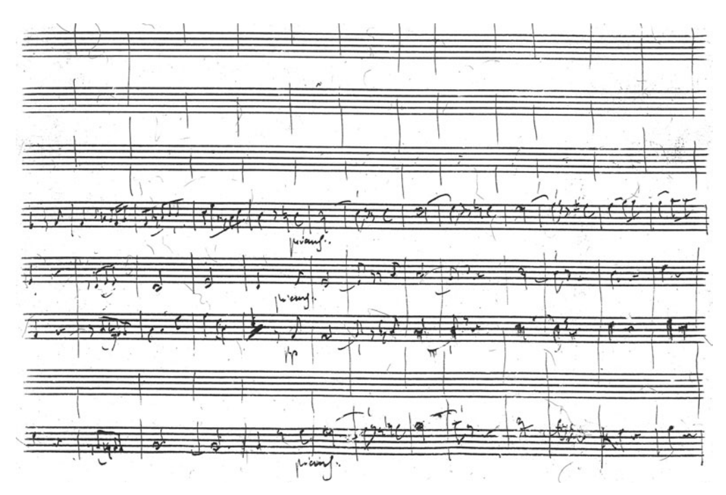
Figure 2 Page from the autograph manuscript of Haydn, Symphony No. 84/iv, bars 215–217.

bass line) has an E $\sqrt\$ in bar 58 of Example 4 and, consequently, a cautionary E $\sqrt\$ in bar 59; and in the finale the length of the note of resolution in the various string parts is mainly crotchets. This line of transmission – from autograph score via manuscript parts to printed parts – would allow the earlier theory that the subsequent quartet version was instigated by Artaria and was based on a new score prepared from either the manuscript parts or the recently engraved orchestral parts.