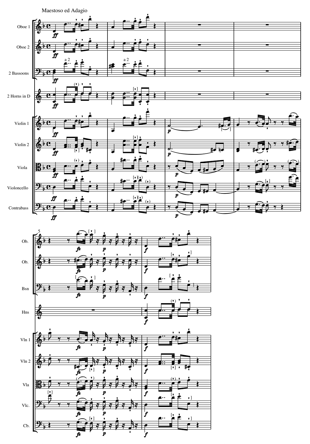
Example 1 The Seven Last Words, Introduzione (Joseph Haydn Werke, series 4, Die Sieben letzten Worte unseres Erlösers am Kreuze, Orchesterfassung, ed. Hubert Unverricht (Munich: Henle, 1959)). Used by permission