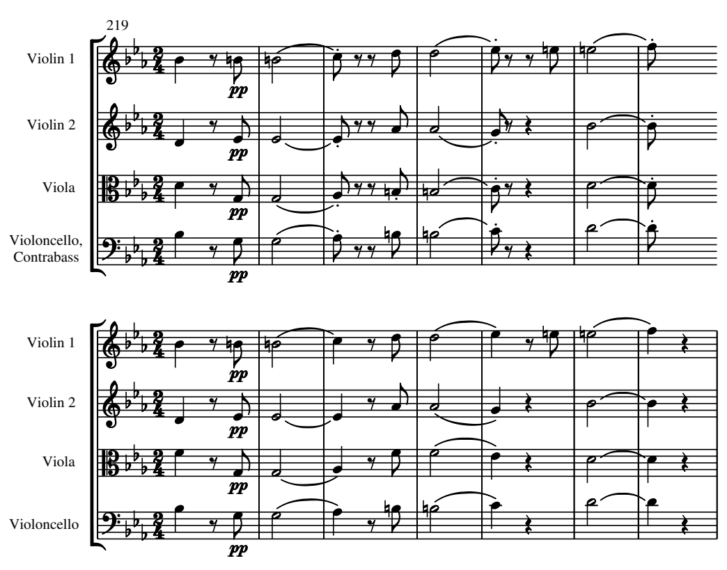
Example 5 Symphony No. 84/iv, bars 219–225 ( Joseph Haydn Werke , series 1, volume 13: Pariser Sinfonien , 2. Folge , ed. Sonja Gerlach and Klaus Lippe (Munich: Henle, 1999)). Used by permission. Quartet: Artaria (1788)

his first thoughts were to use the E \natural but the decorative semiquaver patterns in sixths in the upper voices were producing clashing E \flat s; to avoid the semitone dissonance he erased the natural sign in the autograph and the now redundant cautionary flat sign in the following bar. In the quartet version the E \natural survives.