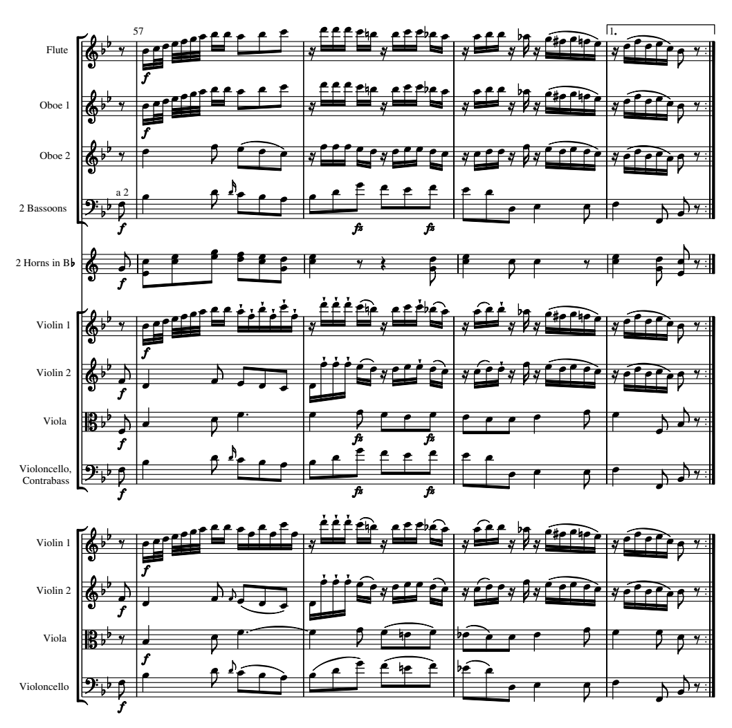
Example 4 Symphony No. 84/ii, bars 57–60 ( Joseph Haydn Werke , series 1, volume 13: Pariser Sinfonien , 2. Folge , ed. Sonja Gerlach and Klaus Lippe (Munich: Henle, 1999)). Used by permission. Quartet: Artaria (1788)

The complete autograph scores of two of the symphonies, Nos 84 and 86, survive.<sup>37</sup> Two instances of second thoughts in the autograph score of No. 84 are revealing. Example 4 presents the symphony version and the quartet version of a passage from the Andante. The most significant difference is the change in the thematic bass line in bar 58, from E_{\flat} in the symphony to E_{\flat} in the quartet. At this point the autograph score of the symphony contains evidence that something was erased before this note; that it was a natural sign is suggested by another erasure in bar 59 before the first note, probably of a cautionary flat sign.<sup>38</sup> The compositional history of this change in the autograph score of the symphony is easily reconstructed. The movement is a set of variations that had contained this E_{\flat} in the original theme (bars 2 and 6) and most of the equivalent points in the two major-key variations (bars 30, 34, 46 and 50). (The first variation is in the tonic minor and, consequently, harmonically recast.) When Haydn came to write the thematic line in bar 58,