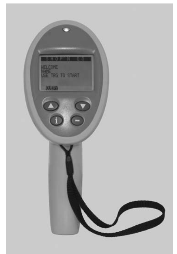
Fig. 1 Hand-held barcode scanner (Shop 'N Go system)

A 12-week single-blind RCT was conducted at a supermarket store in Wellington, New Zealand, between April