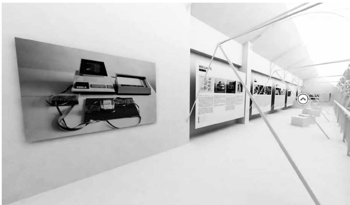
1 Screenshot of the virtual exhibition ‘Artificial Intelligence & Architecture’.

Chaillou shows us how Generative Adversarial Networks (GANs) can be used to develop a large range of floor plans layouts and how Machine Learning (ML) can be used to recognise and classify facade elements or transfer ‘styles’ to make modern floor plans resemble baroque ones. He also shows how design optimisation techniques profit from AI and how many tedious aspects of the profession – like allocating spaces inside a building envelope in endless iterations – can be automated and streamlined. This is evident in so called ‘latent spaces’ of possible and plausible design alternatives that can be easily generated and then evaluated using AI tools. AI can also invoke ‘surrogate models’ by