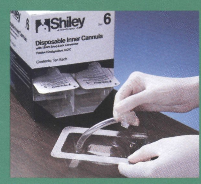
Step 3 — Remove new cannula from sterile container.