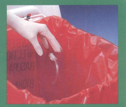
Step 2—Discard disposable inner cannula in appropriate container.