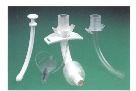
DIC is used with all Shiley disposable cannula tracheostomy tubes.

Since the DIC was first introduced, doctors, nurses and therapists have accepted it as a significant advance in reducing the risk of contamination and infection, as well as a time and cost saver. Tracheostomy care procedures can be simplified and trach care kits can be eliminated.