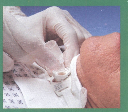
Step 4 — Insert new DIC and proceed with prescribed trach care.

Step 3—Remove the correct size DIC from its sterile container by the pinch clamps of the snap-lock connector using aseptic technique.