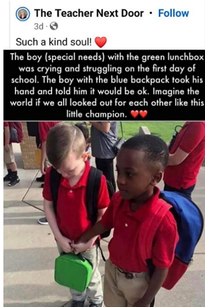
Figure 1. The Teacher Next Door, “Such a kind soul!” Facebook, May 5, 2024, https://www.facebook.com/search/top/?q=the%20teacher%20next%20door%20such%20a%20kind%20soul! .

looked out for each other like this little champion” reframes imagination as the possibility of human connection, not as a game de-centering the one experiencing the disruption. Figure 2 follows this same demonstration of empathy when an observant flight attendant, responding to a distressed passenger, “explained every sound and bump and even sat ... holding her hand when it still got to be too much for her.” These two individuals respond to a circumstance wherein their perceptive observations of others in distress do not lead with the fundamental impossibility and faulty emotional and spiritual prerequisite of “I know how you feel.”