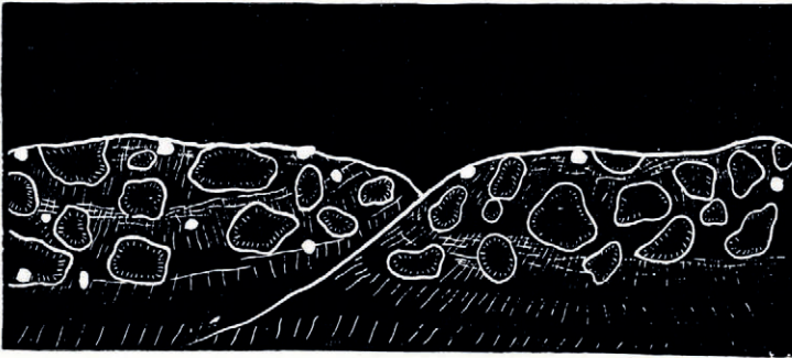
DRIFT CAVITIES, OR "POTASH KETTLES," near Greenbush, Wisconsin. Range of drift hills looking west. ○ ○ ○ Boulders of Northern rocks—base 150 feet above Lake Michigan.