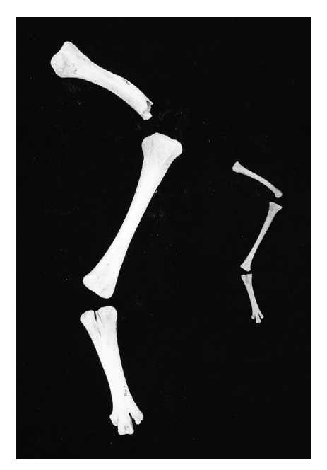
1.3. Comparison of the limb bones of a modern broiler chicken (left) and its ancestor, the red jungle fowl of Asia (right) at the same age of ~6 weeks. The jungle fowl can go on to live a decade or more, while the broiler chicken has reached slaughter age (and would not live much longer in any case). Image copyright of the Trustees of the Natural History Museum, London. The two specimens are held by the Natural History Museum and the University of London. Image reproduced here with permission.

worldwide, the contemporary continuation of the megafaunal extinctions, is at least obvious; these are large targets. But the extraordinary decline in flying insects is less obviously intuitive, as one thinks of flies, wasps, mosquitoes, and midges as the ultimate survivors, organisms that can survive and flourish in any circumstances. Hence, the palpable sense of shock that followed the beautifully conducted if deeply sobering study of the Krefeld Entomological Society, that showed these age-old pests of humans to be sensitive and indeed acutely vulnerable to changes in the world around them.<sup>28</sup> The study is a classic example of painstaking, systematic, methodical – and, to be sure, highly tedious – data collection, with no guarantee that any striking scientific result will