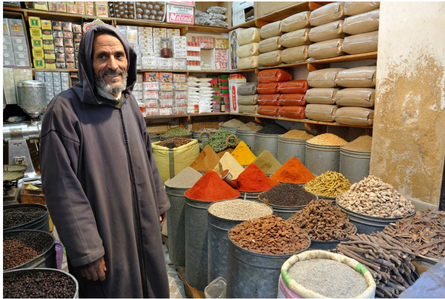
Figure 1: Spice seller in the medina of Fes, Morocco.