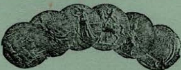
Gold Medal Allahabad 1910.

Paris 1900, Brussels 1910, Buenos Aires 1910.