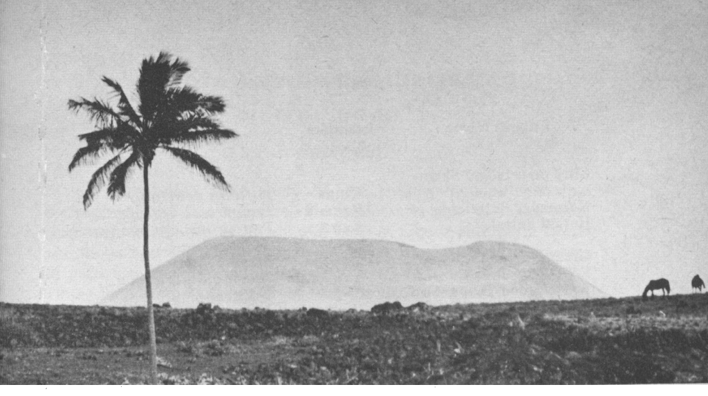
Typical coastal scene on Easter Island with old volcano in the background. The lone coconut-palm and the now feral horses are both introduced.

Despite many past disturbances and present limitations, here we have a uniquely remote tropical ecosystem, which remains of the highest interest by virtue of its physical immunities as well as its unique cultural associations. I suggest the need for closer study, with vigorous support for the Chilean Government. As well as paying the necessary priority attention to conserving the archaeology and prehistory of the island (now actively in hand), attention should be turned to the almost equally immediate problems of the environment there as a whole, including the new hotels and other buildings at present being planned. In such a wonderful, beautiful, completely 'different' place — unspoiled indeed — it would be a tragedy if exploitation were to distort one acre. disappeared. The island has been forested erratically with groves of eucalyptus and other trees. Practically every inch of it not otherwise employed is grazed by the horses and cattle.