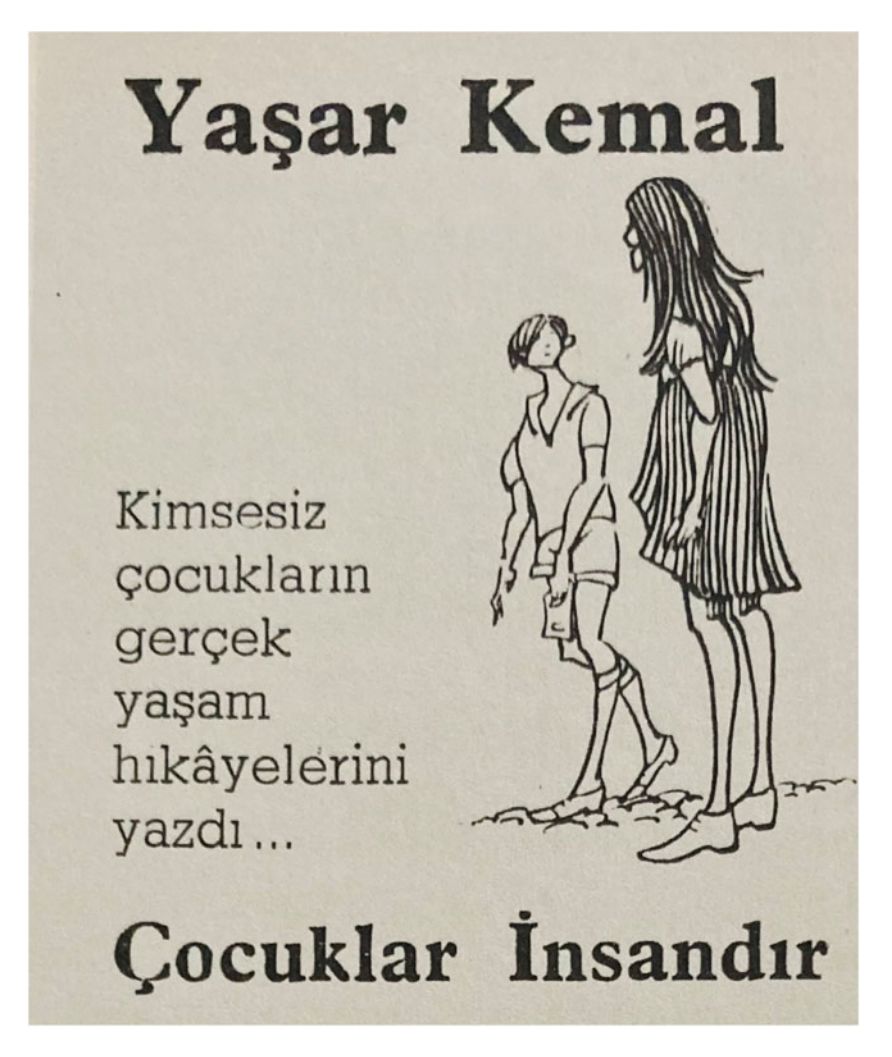
FIGURE 1. Advertisement for the series "Çocuklar Insandır" (Children Are Human): "Yaşar Kemal has written the real-life stories of destitute children." Illustration by Turhan Selçuk. Cumhuriyet , 13 September 1975.

typical placement for serial articles.<sup>35</sup> Daily installments, often filling up the entire page, were separated into several subsections with dramatic subtitles and were accompanied by the illustrations of the well-known cartoonist Turhan Selçuk (1922–2010) and photographs by the world famous photographer Ara Güler (1928–2018). Advertisements for the series, also featuring illustrations and photographs, appeared several days prior (Figs. 1 and 2). The first installment, entitled "Why Are Children Human?" (Neden çocuklar insandır?), was actually the introduction to the series in the form of an interview with Kemal conducted by the poet and the literary editor of Cumhuriyet at the time, Kemal Özer (1935–2009). The following installments sometimes focused on one child, sometimes a small group of children, tracing their stories in a number of episodes.<sup>36</sup> As to literary style, the series reflected