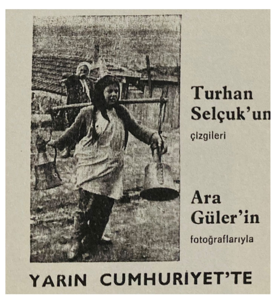
FIGURE 2. Advertisement for the series "Çocuklar İnsandır" (Children Are Human) noting Turhan Selçuk as illustrator and Ara Güler as photographer. Cumhuriyet, 13 September 1975.

Kemal's "childlike, fairytale-like narration, as if the narrator and the narrated were all people of the same world." Kemal was a "wordsmith", and proved his mastery in dialogue writing, incorporating children's street lingo and turns of phrase into written literature. 38