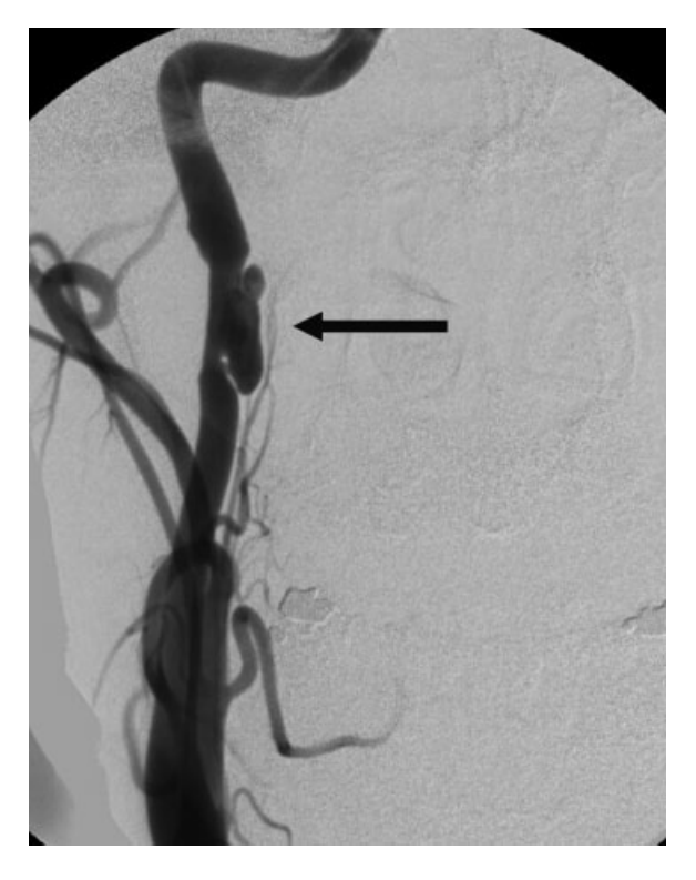
Figure 2: Anterior-posterior cervical carotid angiogram showing dissection of the distal extracranial internal carotid artery with aneurysm formation (arrow).