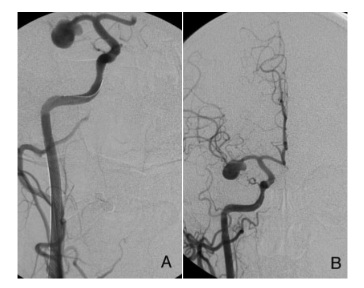
Figure 4: Same patient as Figure 3. Anterior-posterior cervical (A) and cranial (B) right carotid angiograms after emergency stenting with immediate restoration of normal vessel diameter and cerebral perfusion. The patient experienced rapid recovery of her neurological deficits. Craniotomy and microsurgical clipping of the aneurysm was performed and the patient had an excellent outcome, with no residual neurological deficits.

In patients with evidence of hemodynamic insufficiency due to severe stenosis or occlusion, antithrombotic therapy is unlikely to be of benefit and augmentation of cerebral blood flow is required on an urgent basis. Medical management with induced hypertension and hypervolemia can be instituted in patients without cardiorespiratory compromise and, if symptoms persist, intervention aimed at restoration of normal vessel diameter to improve cerebral perfusion may be considered. Those lesions located near the skull base are particularly hazardous to approach and difficult to repair surgically. Extensive exposures necessary to achieve adequate proximal and distal vessel control may result in significant cranial nerve damage. If the injured vessel is inaccessible, proximal occlusion or segmental isolation are the most common approaches.<sup>29</sup>