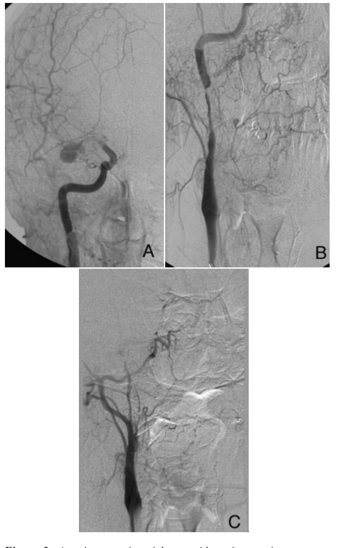
Figure 3: Anterior-posterior right carotid angiogram in a woman presenting with subarachnoid hemorrhage. A: The first run shows delay of contrast flow and only partial filling of the cerebral circulation. A right middle cerebral artery bifurcation aneurysm is identified. B: Second angiographic run, 5 minutes later, shows progressive stenosis due to expansion of the intramural hematoma. C: Third angiographic run, 15 minutes after the original series, shows extension of the dissection to the level of the skull base and near occlusion of the right internal carotid artery. The patient became acutely symptomatic with left hemiplegia.

hours or days later by symptoms of transient cerebral or retinal ischemia or stroke, most often in the territory of the middle cerebral artery. Only about 20% of patients have an ischemic stroke without any preceding warning signs.<sup>3</sup> Vertebral dissections may present with pain at the back of the neck or suboccipital headache, followed by ischemia in the posterior circulation. The initial manifestations of vertebral artery