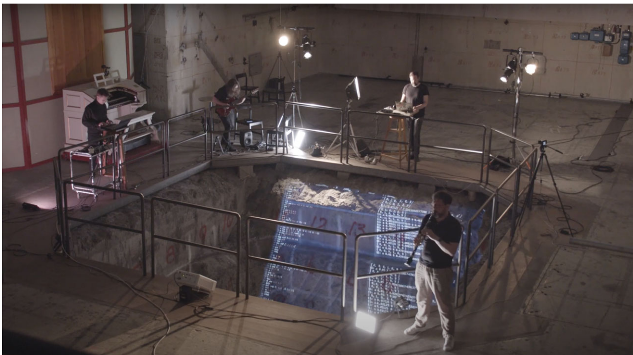
Figure 4. The TCP/Indeterminate Place Quartet performing as part of the NIME 2021 conference, controlling the Skandia Cinema Organ in R1 (pictured), Stockholm, and the Utopa Baroque Organ in Orgelpark, Amsterdam, 16 June 2021.

random ones. Instead, those patterns can be of arbitrary length and produce both note degrees and chords within this scale, taking advantage of both SuperCollider's extensive pattern library and any user-defined pattern algorithms. Typically, scales are represented as ascending arrays of numbers; for example, [0, 2, 3, 5, 7, 8, 11] for a harmonic minor scale. Scrambling such an array to something like [5, 3, 2, 7, 0, 11, 8], means that a note degree of 0 would not return the tonic (0) as one would expect, but instead 5. A degree of 6 returns 8 instead of 11 and so on. From a