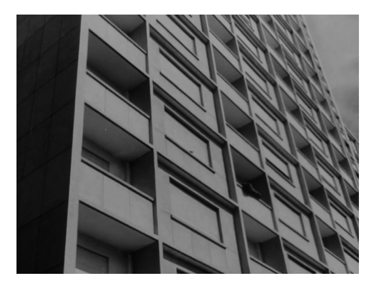
Figure 7 Borrom Sarret.