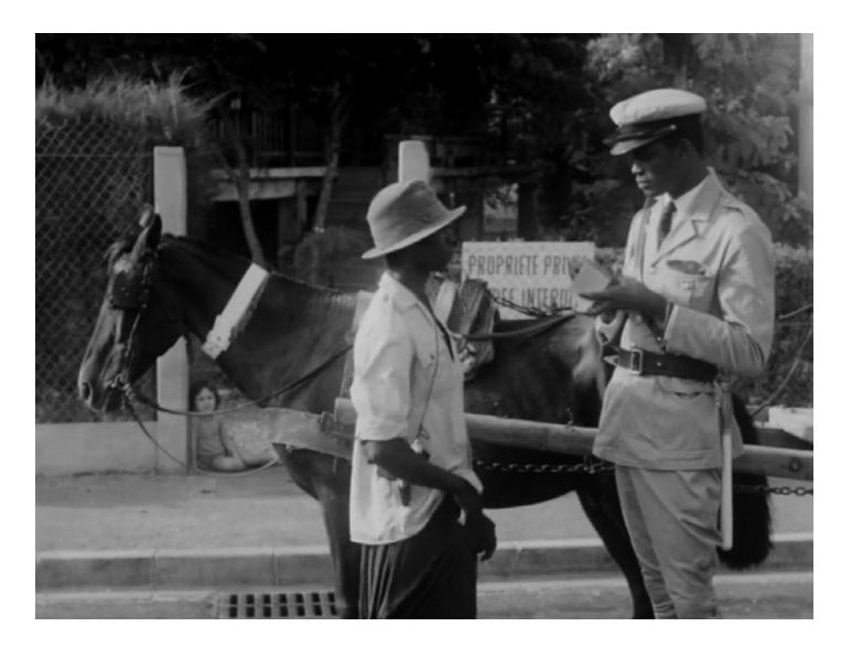
Figure 9 Borrom Sarret.

Sembène's parable is stark and powerful, but Djibril Diop Mambéty is the filmmaker who most incisively explored the spatiality of twentieth-century Dakarois urban inequalities. Mambéty was born to Lébu parents in 1945 in Colobane, one of the original African neighborhoods that adjoins Médina. Many of his films are at once affecting tributes to Colobane and highly critical explorations of the stratified city around it. Among these, his first film, 1968's Contras' City, stands out. A study of Dakar in the 1960s, the short film is presented largely without plot but with wry narration and soundtrack. Like Sembène did before him, Mambéty documents the alienating French-ness of the Plateau in post-independence Dakar-government buildings are blindingly white and garishly neoclassical despite the Senegalese flag that adorns them. But Mambéty is more interested in outlying African neighborhoods and the hybrid cultural forms he finds there. His camera pauses on material and human details: wax textiles shifting in the breeze, produce and commodities in markets, a structure that looks like Sudanese architecture but is actually a gas station. He also captures bits and pieces of the French presence that have been cannibalized by the inhabitants of the city and made into something new.