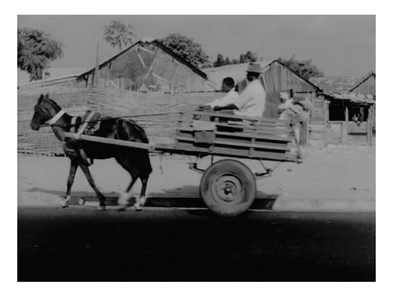
Figure 3 Borrom Sarret.