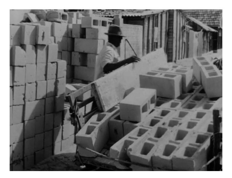
Figure 5 Borrom Sarret.