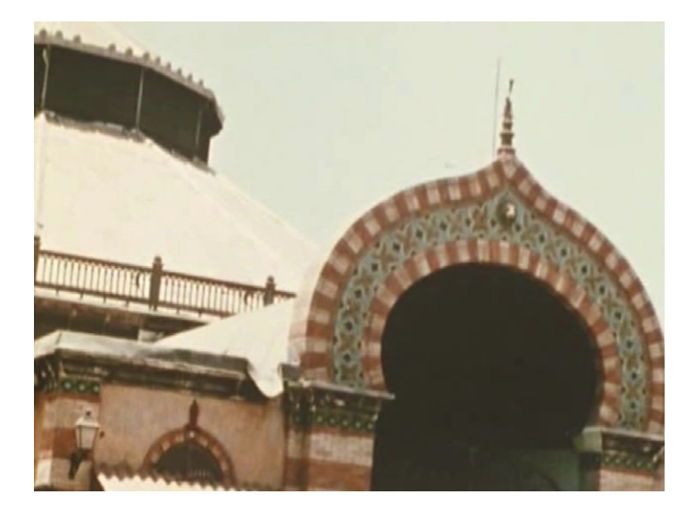
Figure 10 Marché Kermel in Contras' City.

century Europe that so haunted Walter Benjamin and a synthetic neo-Moorish style that was in vogue at the turn of the century.<sup>50</sup> Most consequentially, Marché Kermel was also the target of the Lébu's general strike of 1914 against the clearing of Africans from the Plateau. It was here that Europeans or their servants went to buy food, and where Lébu fisherman and market women shut down the Plateau in response to the burnings (fig. 11). Marché Kermel is a haunting presence in Mambéty's films.<sup>51</sup> The sequence that features the market in Contras' City invokes (without naming directly) the sufferings of the plague year and the displacement of the Lébu that followed, but also conjures the memory of how the Lébu fought back.<sup>52</sup>