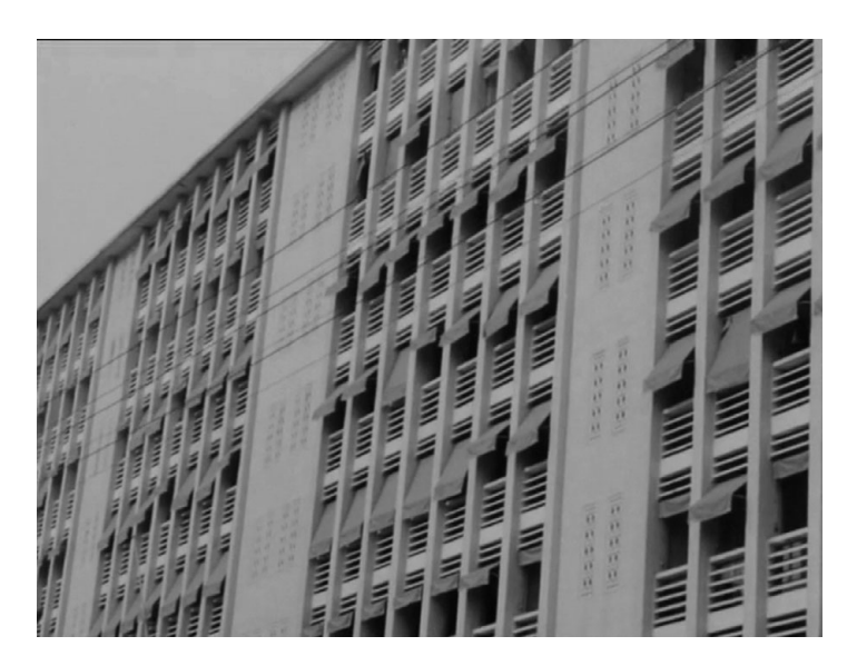
Figure 8 Borrom Sarret.