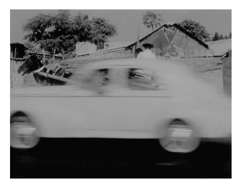
Figure 4 Borrom Sarret.

sarret is confronted by a policeman and arrested (no horse carts in the Plateau) (fig. 8). The young man in the suit slips away without paying, and the borom sarret must return home with just his horse. A private property sign hangs prominently from a fence in the background as the horse cart driver is expelled from the Plateau, a reminder of earlier expropriations (fig. 9).