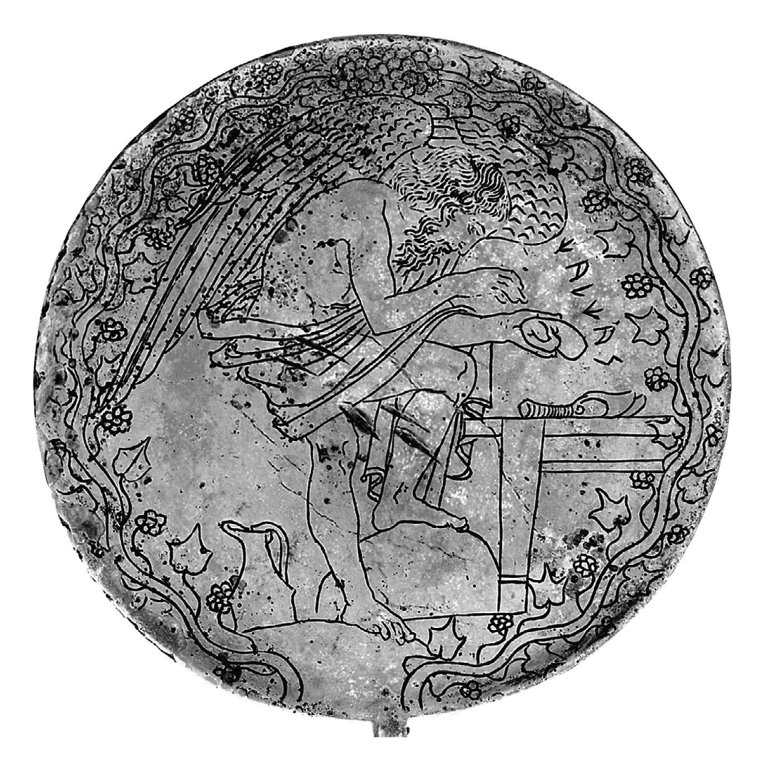
8 The famous seer Kalchas, here bestowed with wings as a token of his ability to communicate with the gods, taking extispicy from an animal liver. Bronze mirror from Vulci from the fourth century CE.