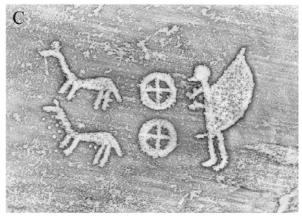
10 Frottages made by Dietrich Evers showing an anthropomorphic figure with an avian creature sitting on its hand from Järrestad 13 in Scania (left); detail from Tanum 9 (above right), notice the ship- and razor-like form of the body and head of some bird figures, and notice that one of the birds seems to be depicted with human feet; and an example of an engraved winged anthropomorph with a beak (below right), this one is from Ånneröd, Skee 625.

"dancing" anthropomorphic figure seems to be depicted with birds sitting on its hands (Figure 10). 65