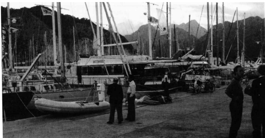
Marina at the site of the conference banquet.