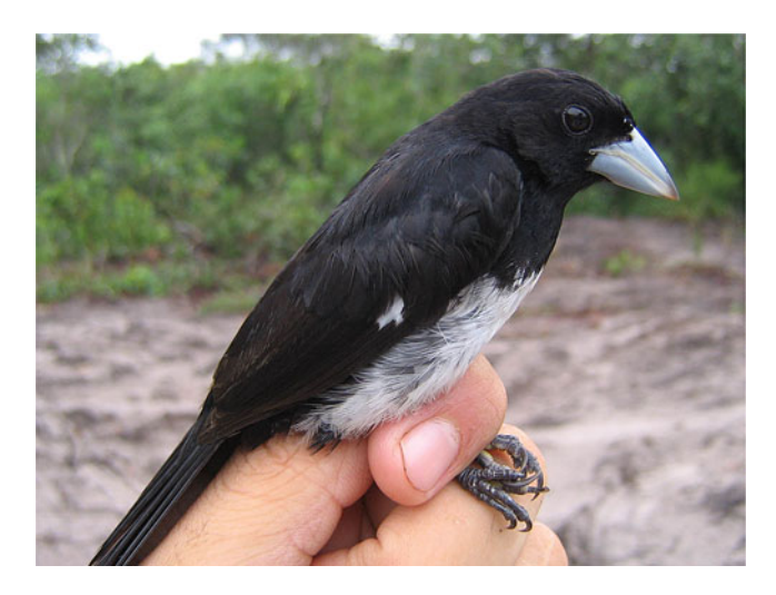
Figure 2. Male Cone-billed Tanager Conothraupis mesoleuca from the upper Juruena River, captured at site 11 (Fig. 1C), Sapezal, Mato Grosso, Brazil. Note the slight rictal commissure and the dark coloured bill tip.

forest or scrub" (Berlioz 1946, Storer 1960), or "bushy vegetation among dry forest" (Isler and Isler 1987). These earlier descriptions suggest cerrado , which is the dominant physiognomy of the Chapada dos Parecis. Thus, if the species really selects flooded areas, those habitat descriptions may have delayed the rediscovery of the species by leading researchers to look in the wrong habitats (Buzzetti 2006).