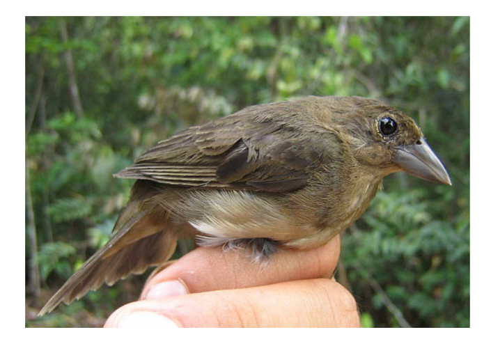
Figure 3. Female Cone-billed Tanager Conothraupis mesoleuca from the upper Juruena river, captured at site 13 (Fig. 1C), Sapezal, Mato Grosso, Brazil.

Although the Cone-billed Tanager is strongly responsive to playback (CCG and LFS pers. obs.), it was found in only 14 of 146 playback sampling points. We believe that this could suggest low population density. However, accurate population size estimation will require even more intensive effort in the appropriate habitat types. Here we found around 40 individuals (see