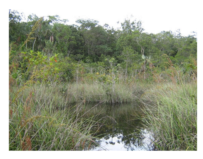
Figure 4. Flooded grassland with scattered shrubs and Moriche Palms Mauritia flexuosa in Juruena riverside (site 12 in Figure 1C; photo C. Candia-Gallardo).

Appendix 1), but several areas of potential suitable habitat exist in the Chapada dos Parecis that have not yet been visited by ornithologists; therefore population size could be larger. These areas, comprising a mosaic of private and indigenous lands, are prime targets for new surveys (see discussion).