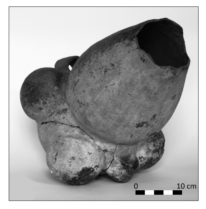
Figure 2. La Candelaria-style ceramic vessel showing biomorphic 'protrusions'. (Museo de La Universidad Nacional de Tucumán)

When faced with this body of material the immediate question is what does it mean? A conventional answer is that it represents the beliefs of past peoples. The task of archaeologists is then to re-construct more-or-less accurate interpretations of the underlying meanings inherent in the vessel forms and their imagery. Since the pots and their imagery fit within a generally Andean framework of beliefs, they are taken to indicate or to have been involved in ritual and other activities (e.g. DeMarrais 2007; González