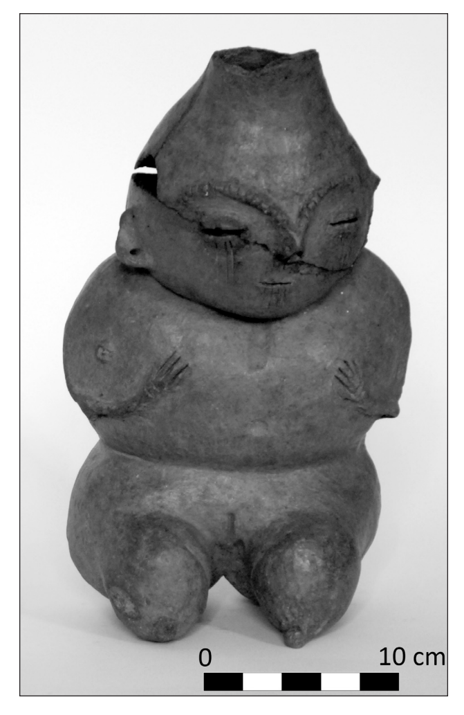
Figure 4. La Candelaria-style anthropomorphic bodypot. (Museo de la Universidad Nacional de Tucumán; photograph, B. Alberti.)

Working with the concept of the 'chronically unstable body' elaborated on the basis of the theories of the northwest Amazon group, the Wari', by Aparecida Vilaça (2005; see Conklin 2001), Alberti (2007) argued that the La Candelaria and San Francisco pots and skeletal material indicated a concern with 'shoring up' the body, preventing its transformation into another body with another point of view. Combining