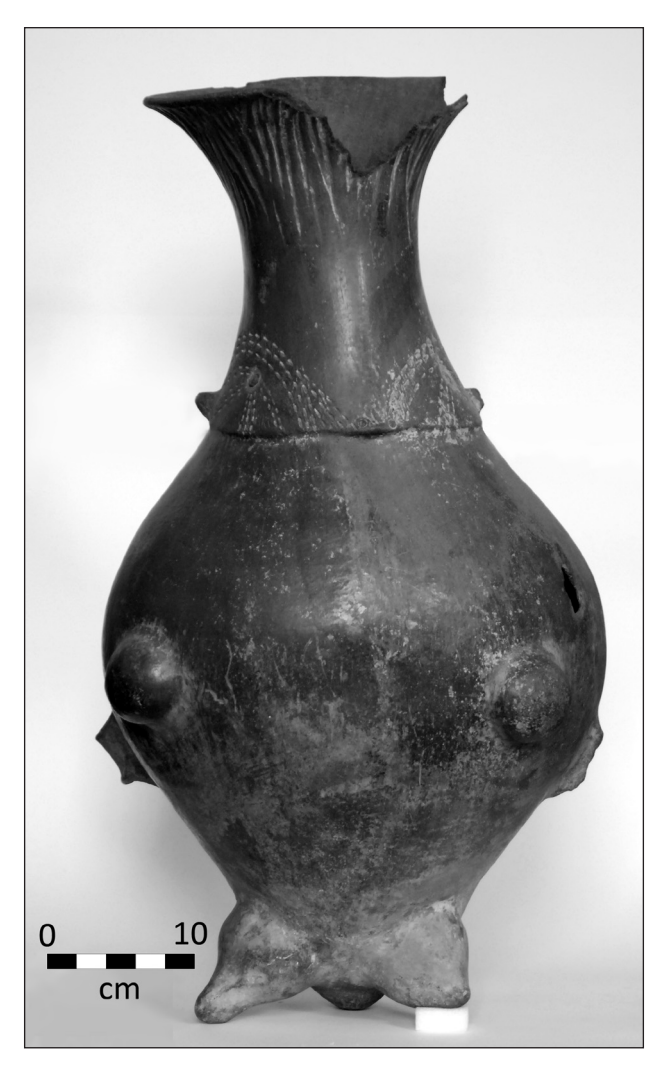
Figure 3. La Candelaria-style zoomorphic ceramic vessel. (Museo de La Universidad Nacional de Tucumán; photograph, B. Alberti.)

'turbulent course' below the separate surface of the bodies that separate species (e.g. Figs. 2–4; Viveiros de Castro 2007, 159). As such, an argument could be made that the vessels are the material embodiment of myth manifested through the establishment of a figurative art tradition, three-dimensional beliefs given greater force by their material permanence. However, analogical reasoning, while important for laying out the possibilities of different worlds, does not necessarily actualize the ontological potential of those worlds. The logic of the myths themselves, if treated as 'the discourse of the Given' (Wagner 1978, as cited in Viveiros de Castro 2008) rather than stories, also reveals the unlikelihood of the pots representing mythic events. If identity conceived as 'disorganized bodies' (Viveiros de Castro 2007, 158) is an ongoing state, a truth