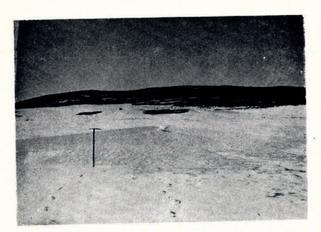
Fig. 3. Ice mound on the frozen lake