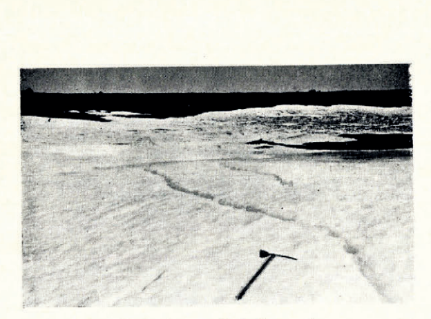
Fig. 1. Crevasses in the ice mound