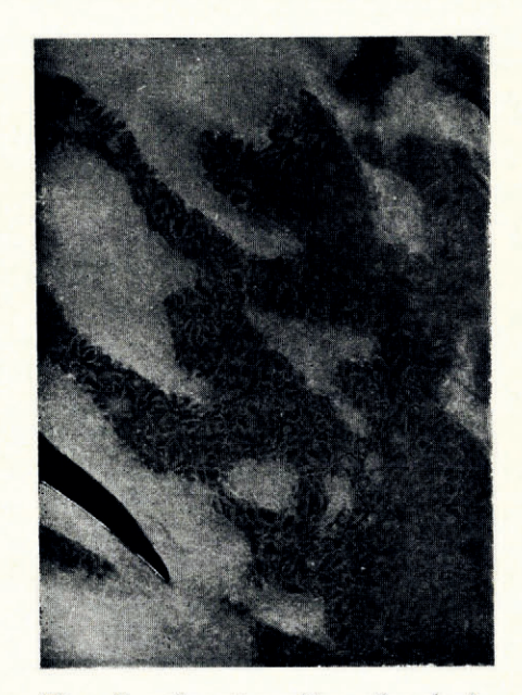
Fig. 2. Same place, upper melting surface, showing the lattice formed by the nearly vertical crystals