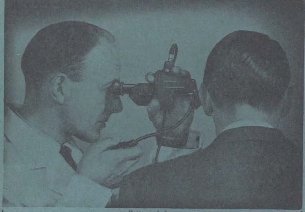
Patt. appl. for

THIS new instrument represents an important contribution to otology. It facilitates accurate clinical diagnosis and operative work of high precision.