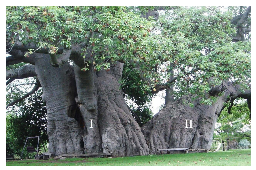
Figure 1 The impressive 2-stemmed trunk of the Platland tree, which is also called Sunland baobab

The tree has a height of 18.9 m and a total circumference at breast height (cbh; 1.30 m above ground level) of 34.00 m. Its footprint of 68.0 m<sup>2</sup> (which corresponds to a nominal diameter at ground level of 9.30 m) and the cross-sectional area at breast height of 65.3 m<sup>2</sup> are the largest known for an African baobab. The trunk consists of 2 stems (I and II), with a cbh of 24.13 m (stem I) and 18.33 m (stem II), see Figure 1. These stems are connected by a partially fused section, which has a maximum height of 2.01 m and covers a shared cbh of 4.10 m.