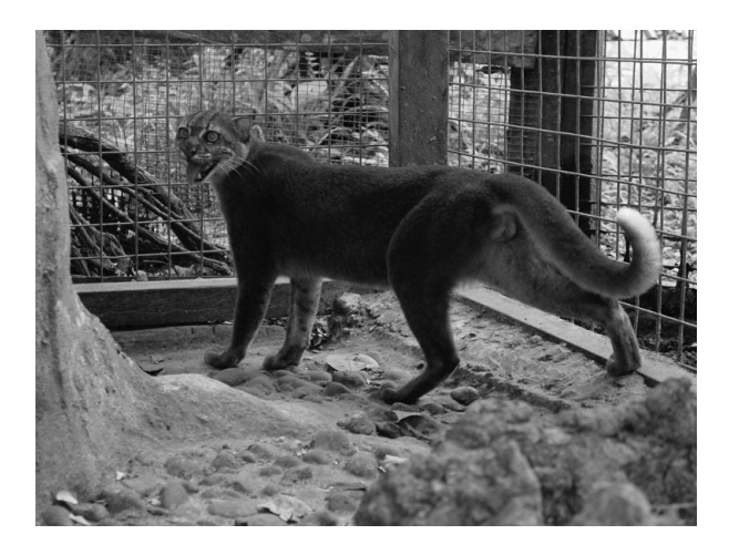
Plate 1 A captive bay cat in Sarawak, 2005.

local people at Ulu Sarikei reported that a bay cat was observed on a branch 1 m from the ground close to the river during a night hunting expedition.