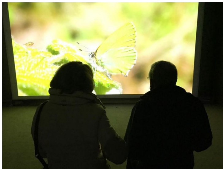
Figure 4 Visitors watching: A day in the life of a Regulated Industry Officer

The film “A day in the life of a Regulated Industry Officer” created by Joshua Sofaer, was shown during the exhibition. (Figure 4) Joshua spent the day filming an EA officer, capturing the officer's working day and their passion for wildlife and the environment through their voluntary work with local environment groups. Visitors reported this ‘provided an unique perspective to environmental regulation by highlighting its intricacies and officers passions’.