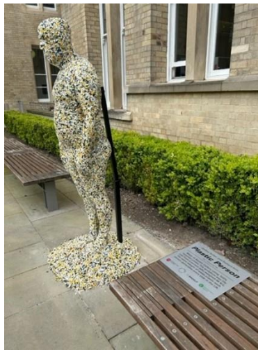
Figure 8 Legacy - Plastic Human at Nottingham Trent University