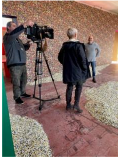
Figure 6 Interview with BBC

An unexpected positive outcome is the collaboration's legacy. We supported BACKLIT in establishing Art NEST, a local eco-group connecting arts venues in Nottingham. Art NEST's current focus is sharing and re-using resources. We supported BECKLIT with their carbon audits and advised on the importance of behavioural change in becoming a more sustainable organisation. This legacy enabled messages catalysed during the exhibition to develop and connected the EA to other local businesses. Such connections led the EA to attend a local Green Festival which 10,000 members of the community attended., Establishing links with local arts-based community groups has provided endless benefits through creating opportunities for engagement.