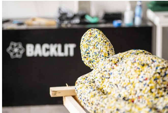
Figure 7 Plastic Human at Backlit Gallery

communication increased the volume of interactions and the number of the local community we educated on environmental issues.