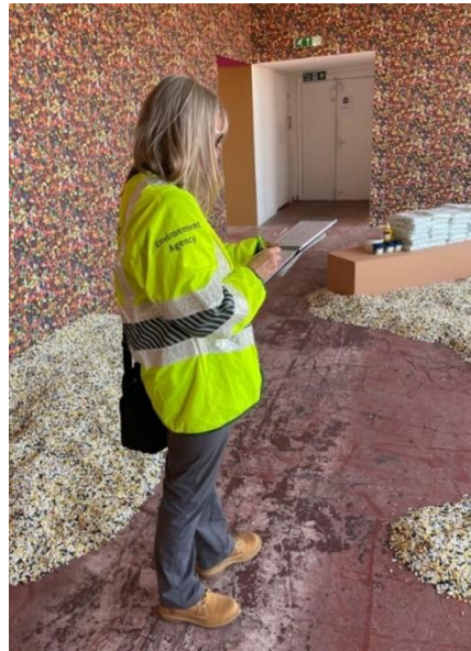
Figure 2 Performative Regulation

One of our aims was to make regulation more transparent, ensuring visibility of Environment Agency's work to protect the environment. This was achieved through performative regulation where post-it notes were placed on the exhibition walls showing the conversation between the regulator and the regulated; in this case BACKLIT Gallery. Performative regulation provided a glimpse into the unseen world of regulation for the audience.(Figure 2 and Figure 3)