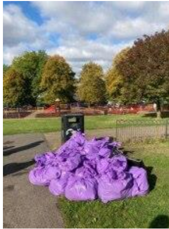
Figure 5 Litter collected