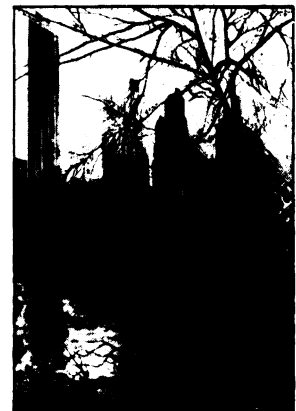
José Martí's Cityscape , original lithograph. Signed limited edition of 225.