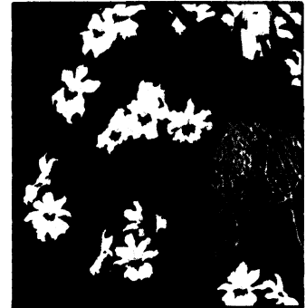
Tjelda Michas' Pansy Orchid , original serigraph. Signed limited edition of 250.