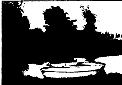
Helen Rundell's Shelter Island , original lithograph. Signed limited edition of 175.