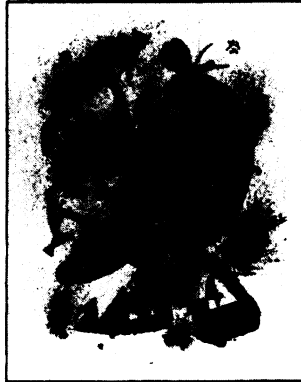
Joan Miro's Obra Grafica: Barcelona '78 , original lithograph. Signed limited edition of 75.