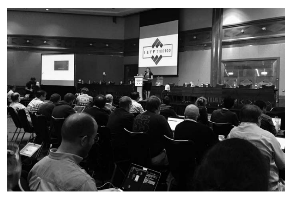
FIGURE 20.2 A 2017 meeting of the Internet Engineering Task Force (IETF).

contributions to the standard (SDOs themselves almost never obtain patent protection over their standards). However, to the extent that patents cover technologies that are "essential" to the implementation of a standard ("standards-essential patents" or "SEPs"), concerns can arise.