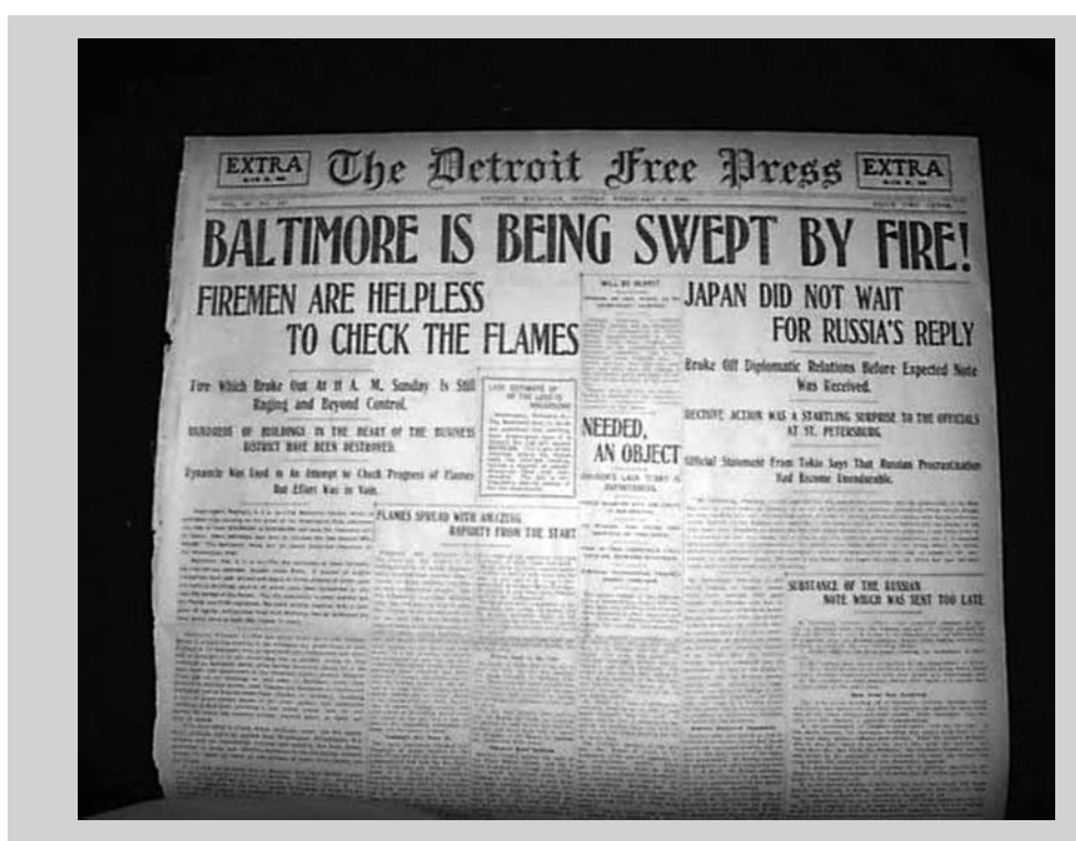
FIGURE 20.1 A lack of standardized fire hydrant couplings resulted in a tragic loss of life and property in the 1904 Baltimore fire.