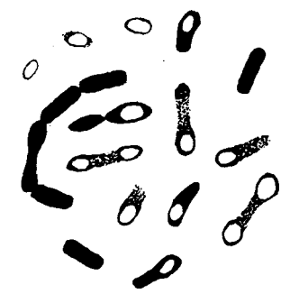
Fig. 1. Representative forms from a two day meat culture.

STAINING and MORPHOLOGY. The bacillus is usually 3--6 times as long as it is wide and it has rounded ends. It may or may not retain Gram's stain. Under uniform conditions it is consistently paler and more gram-negative than B. sporogenes . The spores are oval and subterminal, though a few forms are so short as to be clostridial. Sometimes in meat cultures forms with a spore at either end are common. Gram's stain is more easily washed out from the body of the bacillus than from the sporing end. The organism forms spores readily on most media. On agar plates uniform gram-negative bacilli are the rule. In old meat cultures free-swimming forms disappear, but the mass of the meat is