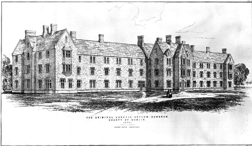
Figure 4.1 The Criminal Lunatic Asylum, Dundrum, Dublin. Transfer lithograph by J.R. Jobbins, 1850, after J. Owen

the prison surgeon. 58 With its two divisions, the largest group of inmates were those committing offences while ‘labouring under insanity’, ‘where the disease itself depriving their acts of legal or moral responsibility, condones the criminality’, while the second, less welcome, group, those becoming insane while in prison, ‘not unfrequently bring with them to the Asylum the same obstinacy, impatience of restraint, and perversity of feeling, which had rendered them unmanageable under prison discipline’. 59 In 1856 twenty-four out of 127 inmates at Dundrum were under sentences of penal servitude. 60