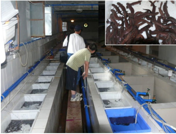
PLATE 1 Typical Chinese giant salamander farm, with rearing pens for young animals. The inset is a close-up view of a rearing pen, showing the high stocking density.

unsurprising; industrial-scale farming, high population densities (Plate 1), and trade in animals between farms across China in the absence of biosecurity measures increase the likelihood of the spread of infectious disease. Although our relatively limited study did not demonstrate a statistical correlation between occurrence of disease and stocking levels, future analyses of a larger number of farms and of industry practice parameters could be useful for indicating possible control measures.