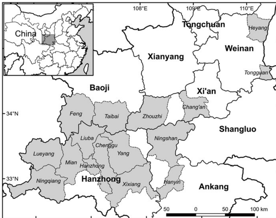
FIG. 1 Locations of cities and counties in Shaanxi Province where surveys were carried out (shaded areas) on Chinese giant salamander Andrias davidianus farms. The rectangle on the inset shows the location of the main map in China.

liver, kidney and spleen, were obtained from this animal for diagnostic investigation. DNA was extracted from tissue and swab samples using a commercially available DNA extraction kit (TIANamp Genomic DNA Kit, Tiangen Biotech (Beijing) Co. Ltd., Beijing, China), following the manufacturer's instructions for DNA extraction from tissue. The extracted DNA was analysed for the presence of ranavirus DNA, using commercially obtained primers (BGI, B-6, Beijing Airport Industrial Zone, Beijing, China) and polymerase chain reaction to detect a 466 base-pair region of the ranavirus genome coding for the C-terminal 163 amino acids of the major capsid protein, as described by Hyatt et al. (2000).