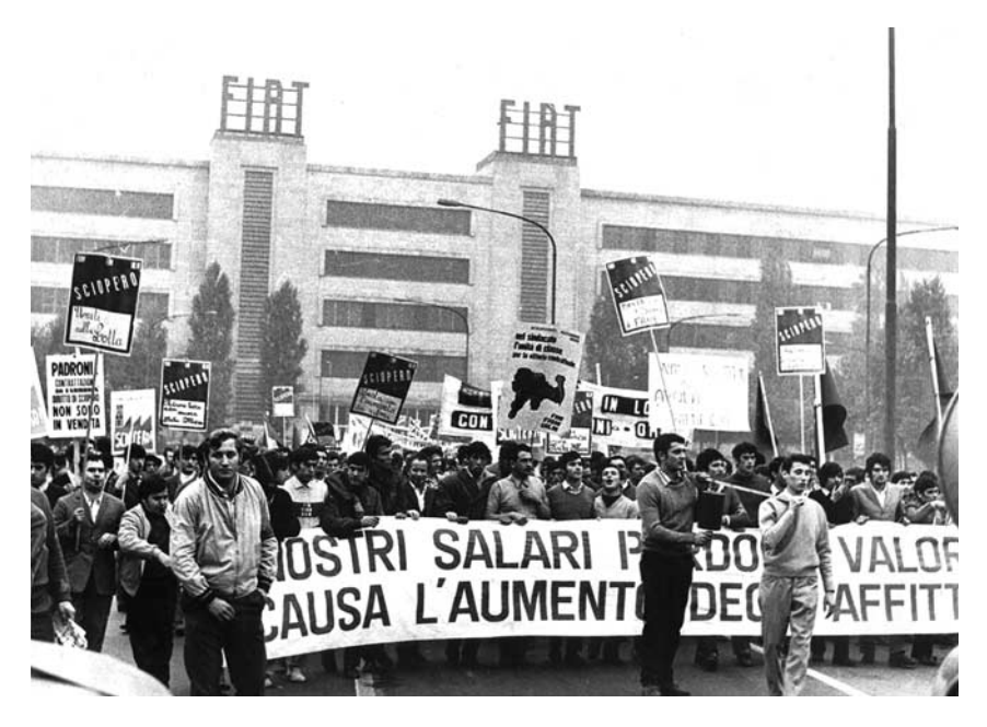
Figure 2. Car workers striking in front of FIAT's Mirafiori plant during the "Hot Autumn", a period of escalating workers' unrest. The photo conveys the boastful enthusiasm of the participants, very often young workers and southern immigrants.

and measured its impact in terms of the actual transformation of the relations of production, rather than the theoretical value of their statements. Raya Dunayevskaya recapitulated this attitude when she wrote that "there is a movement from practice to theory that is literally begging for a movement from theory to practice to meet it".<sup>43</sup> The intended audience for newsletters and pamphlets – their main tangible output – was composed of workers and activists in the labour movement, rather than of members of an intellectual milieu. The distinction between intellectual practices and political practices is slippery (as the former may have a political content and the latter a theoretical significance),<sup>44</sup> but it is nevertheless important to draw, in light of the fact that a great part of the historical evidence pertaining to those groups casts them, retrospectively, more in the role of intellectuals than of political activists.