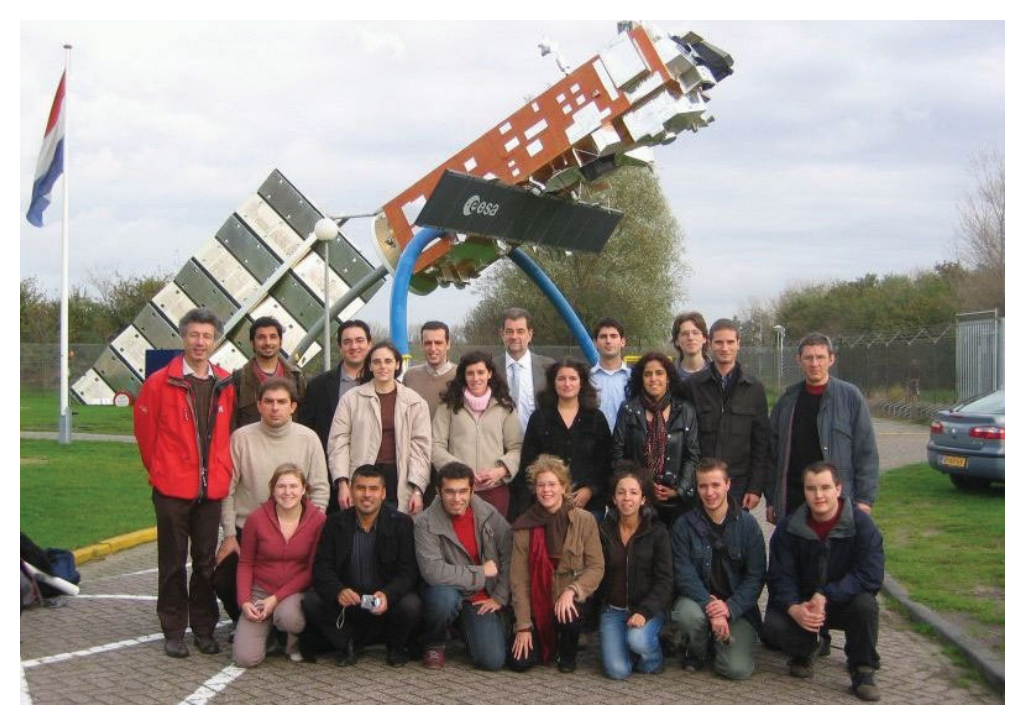
Figure 3. OSAE students visiting ESTEC, the European space research and technology centre.

The degree benefits from the experience and skills of the partners which are involved in the most recent and largest projects in astronomy (e.g., CoRoT, Planck, Herschel, Mars Express, Rosetta, JWST, Bepi Colombo, NAOS/VLT, OHANA, VISIR/VLT, ...). Due