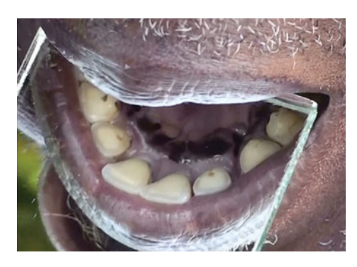
Figure 4 (Colour online): Palatogram of the voiced alveolar plosive in [ada] with contact on the alveolar ridge only.