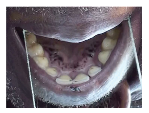
Figure 2 (Colour online): Palatogram of the alveolar plosive in [ata] with well-defined contact on the alveolar ridge only.