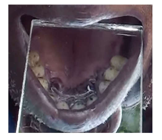
Figure 5 (Colour online): Palatogram of the dental nasal in [ana] showing tongue contact with the back of the upper teeth and the anterior portion of the alveolar ridge.