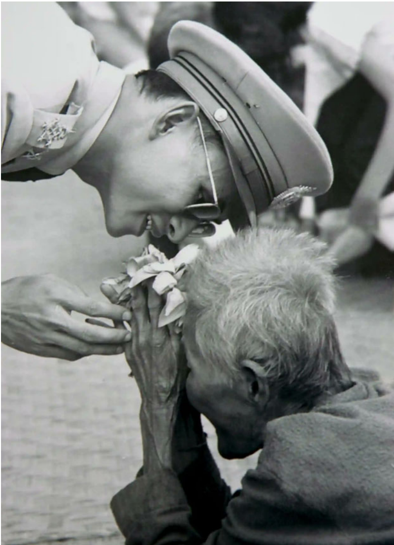
Figure 2. King Bhumibol greets one of his subjects in the central region of Thailand. Uploaded 5 December 2022.

photo—featuring in virtually all state hagiographies of the late monarch 32 —that portrays him bowing compassionately to a poor elderly woman in an act of supreme tenderness (Figure 2).