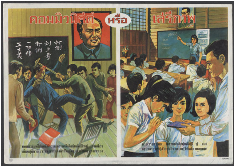
Figure 1. George V. Smith Thai Posters Collection, 'Right to Education', 1960–1969, US Information Service. Source: Southeast Asian Digital Library, Northern Illinois University.

During the 1950–1980s, American-backed military juntas conflated student activism with (Vietnamese-inspired) communism, which—in Cold War Southeast Asia—was demonized by the Thai government as the antonym of Thainess: a disruptive force, threatening the monarchy, Buddhism, and—ultimately—Thailand's moral order. 17 In the following anti-communist propaganda poster (Figure 1), most likely funded by the US Information Agency in the late 1960s, Thai students' gracious submission to their teacher (on the right) contrasts with the communists' brutal assault on authority (on the left). The caption reads: 'We, Thai people, respect adults ( phu yai ) [...]'. 17