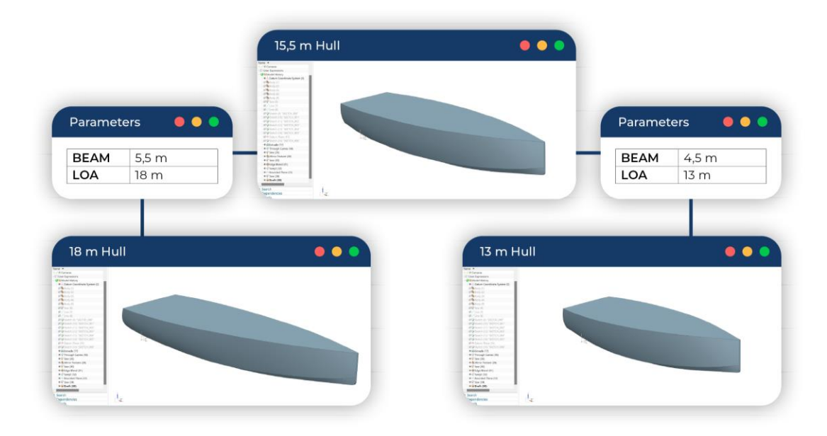
Figure 2. Modifications of the parameters associated with the model