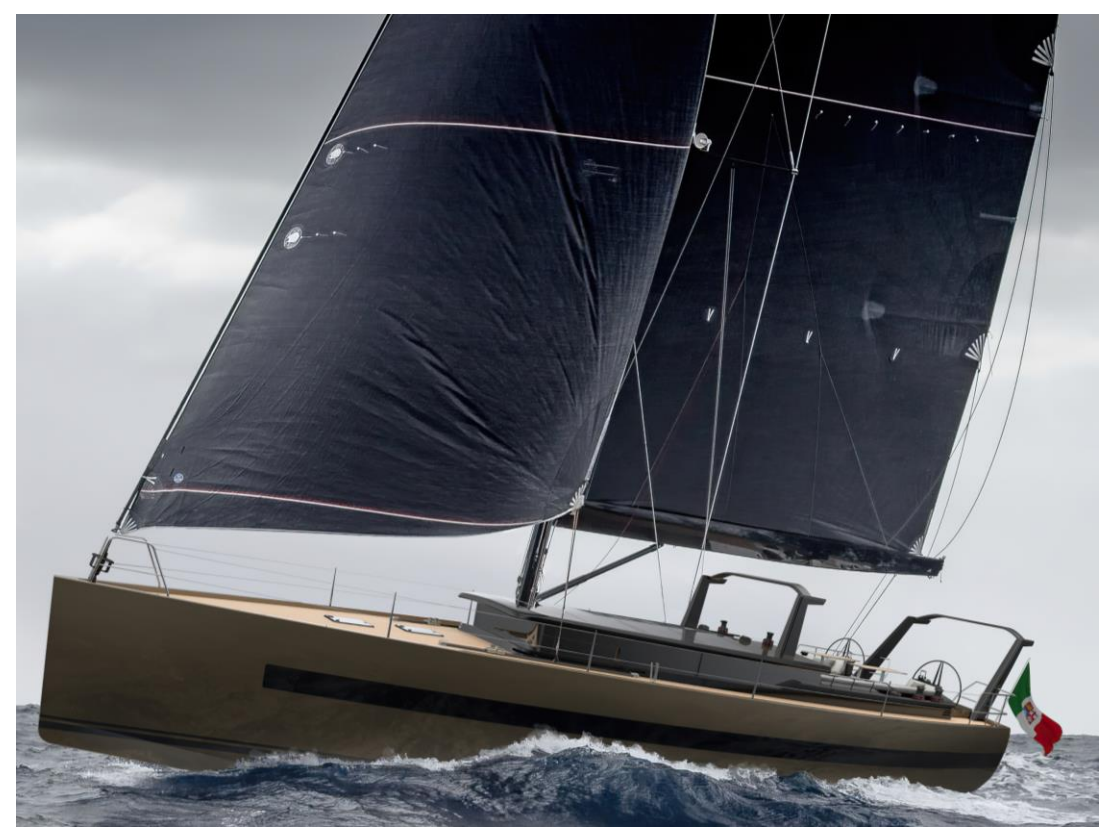
Figure 1. Render of the sailing yacht case study

The research was conducted by two students specialising in Vessel & Yacht Design at the Università di Genova as part of their master's thesis work. One of them completed an internship at a shipyard, while the other gained experience at a yacht design studio. The diverse backgrounds of the research team provided a well-rounded understanding of the diverse facets encompassed in the yacht design process. The research followed a comparative strategy between the traditional and the integrated approach to yacht design. A hypothetical professional scenario was then defined within the yacht industry, with the aim of simulating a realistic framework of reference. In particular, a 50-foot long cruiser-explorer sailing boat was identified as a practical case study for testing both approaches, reflecting the growing trends in cruising and charter in the yachting market.