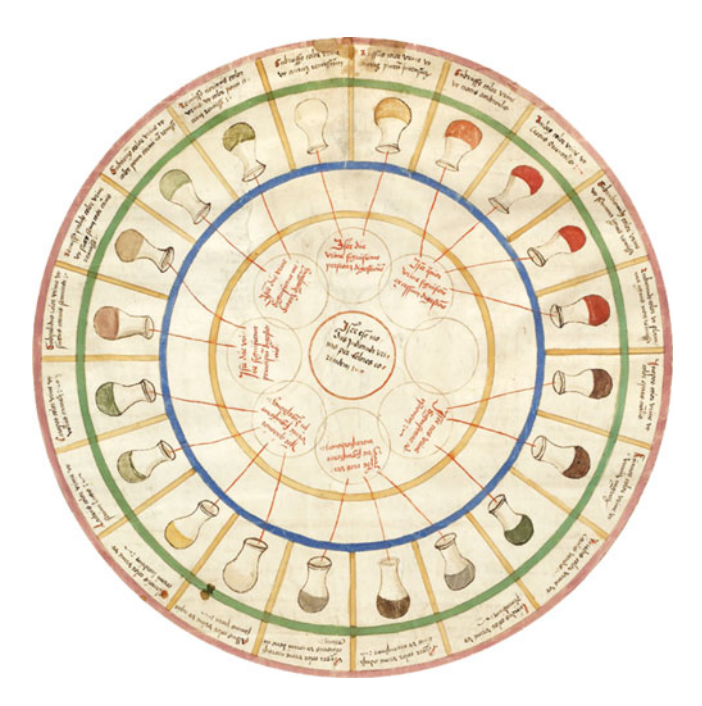
Figure 1. Urine wheel from Epiphanie Medicorum by Ullrich Pinder (1506).

cold, dry) that they shared with them. The theory posited that health derived from the balance of the humours and disease from their imbalance. A diet adapted to the seasons thus avoided or corrected the latter and thereby preserved or restored health.