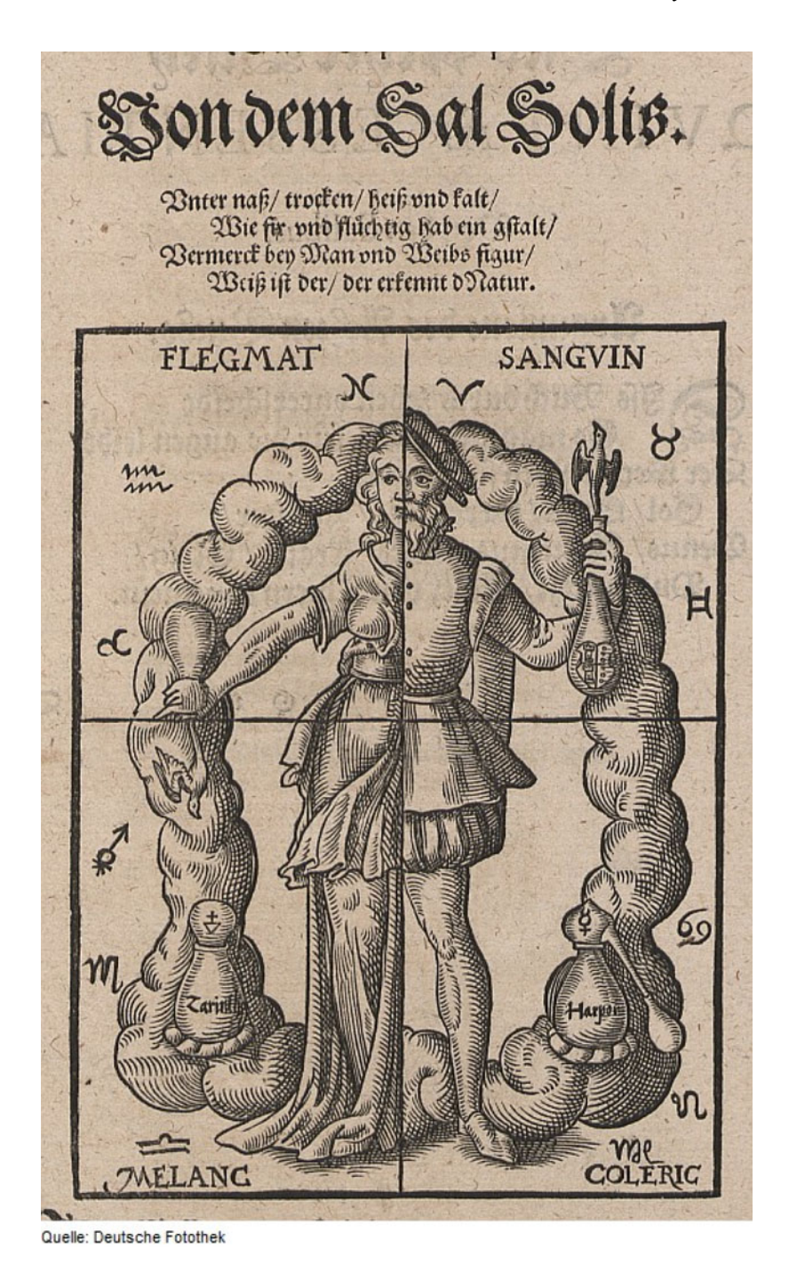
Figure 2. Illustration of the theory of four humours from Theosophie und Alchemie by Leonhardt Turneysser zum Thurn (1574).

dependent on the maintenance or restoration of the equilibria between the inside and the outside, giving much existential significance to what went in. Since different people had different humoural dispositions and temperaments, notably associated with their gender