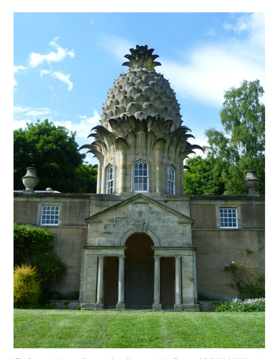
Figure 4. The Pineapple House at Dunmore Park.