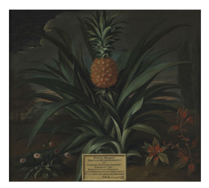
Figure 3. Pineapple grown in Sir Matthew Decker's garden at Richmond, Surrey, by Theodorus Netscher (1720). The Fitzwilliam Museum.

to pronounce such an object delicious, and to desire it as a delicious object', was mediated not by a sensory encounter with the real pineapple, which was inaccessible to him, but by 'the discourse, the world of words, which structure and make desirable the anticipated experience of the chemical object itself'. 98