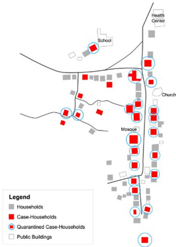
Fig. 1. Schematic map of Village X, Sierra Leone, indicating cumulative Ebola case-household status and quarantine status from 1 August 2014 to 10 October 2014.