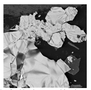
Figure 1: Rutherford backscattered ion image of band gap variation in a cleaved MoS<sub>2</sub> sample using a 37 kV He ion.