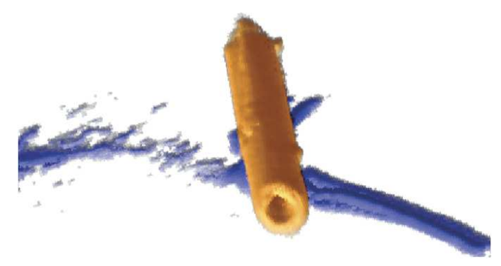
Figure 1: A three-dimensional DART [4] tomographic reconstruction rendering of an inorganic nanotube (orange) and the underlying amorphous carbon support (blue). The tilt series containing 3 487 images was recorded in only 3.5 s, limited by the rotation speed of the goniometer. Picture taken from [2].

[5] The authors acknowledge Xiaodong Zhuge, K. Joost Batenburg and Lothar Houben for their contributions to the tomography measurement.