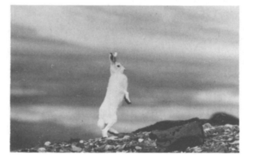
'Animal Behaviour (Mammals)' Arctic Hare