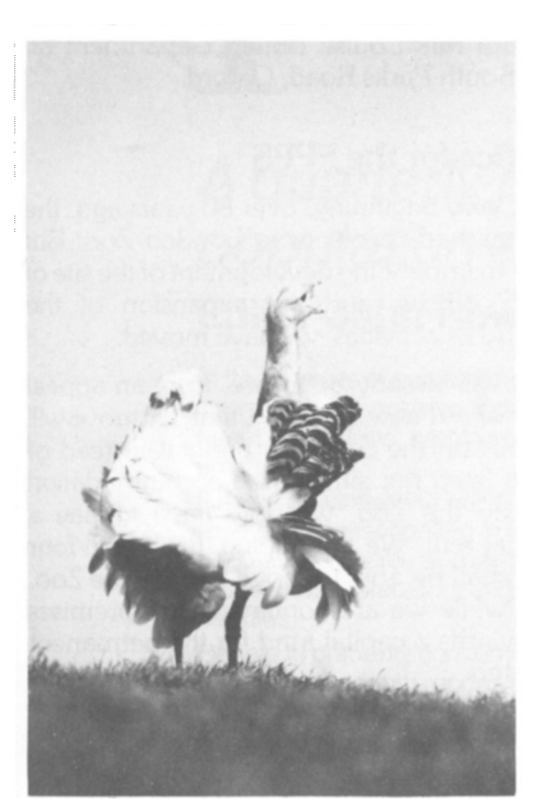
'Endangered Wildlife' Great Bustard by Gyorgy Kapocsy, Budapest, Hungary.