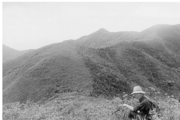
Plate 1 A westerly view of the core area of Yihuang South China Tiger Reserve.

Despite the reputed abundance of sightings and putative tiger traces reported, none could be confirmed and we failed to find any compelling evidence to indicate that