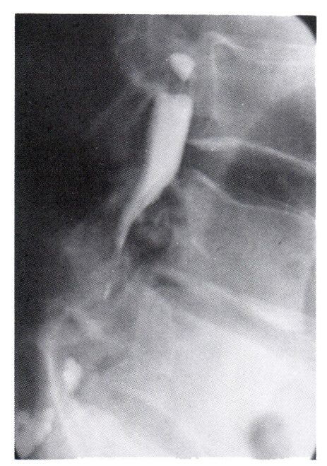
Figure 2A & B—Myelogram in a case of extradural brucellar granuloma (Case 6). Anterior and lateral views show a nearly complete extradural block at the level of the fourth lumbar vertebral body.

brucellar CNS involvement manifested itself by transitory paroxysmal episodes with Jacksonian motor or sensory seizures. They suggested these attacks were probably produced by cerebral angiospasm. Our first case favors such a pathophysiology. Other