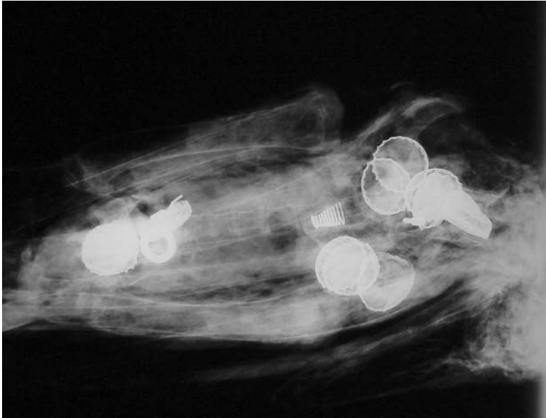
Figure 1. Metallic foreign bodies ingested by nestling SB #285.