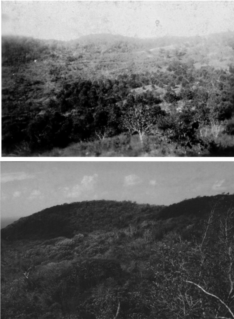
Figure 2. Past and present at the Guánica Biosphere Reserve. A 1931 photograph (top) shows a mahogany plantation amid extensive deforestation near the present reserve headquarters. Bottom photograph of the same area under present conditions showing the abandoned mahogany plantation (centre left) now embedded within mature evergreen forest.

allowing nightjar breeding populations to persist (Figure 2). These plantation forest stands included the most important requirements for adequate nightjar breeding habitat; abundant leaf litter, little or no vegetation near the ground, and a closed canopy. At present, suitable nesting habitat exists at higher elevations in naturally regenerated areas of evergreen and deciduous forest without relict plantations (Molina-Colón and Lugo 2006).