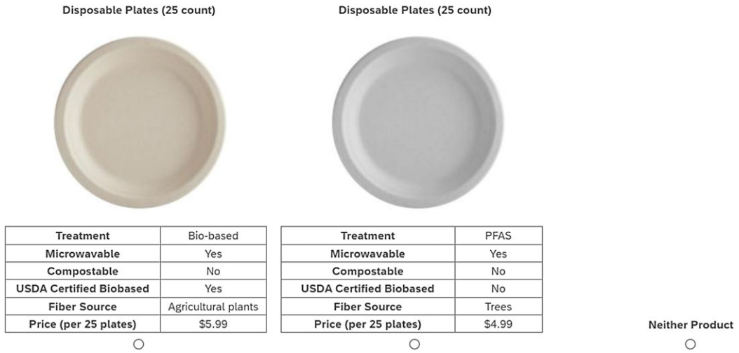
Figure 1. Example choice experiment scenario.

Please select the product that you would purchase from the provided options: