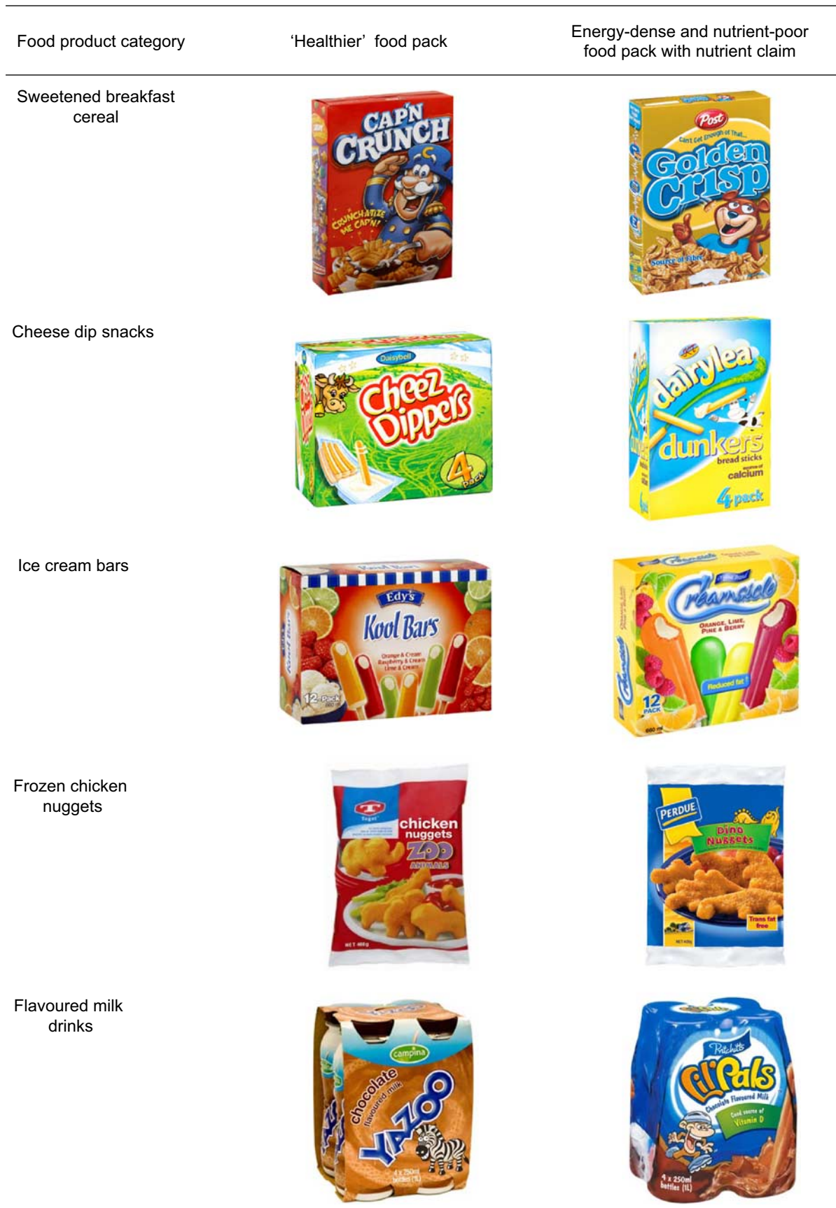
Fig. 1 Example of food packs for nutrient claim promotion condition for each food product category